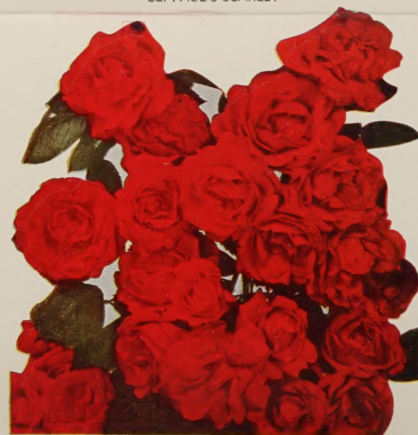
CL. PAUL'S SCARLET